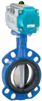
AVK butterfly valve, centric with loose liner, series 820/20