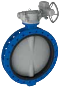
AVK U-section butterfly valve series 820/20