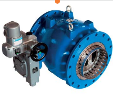
NEEDLE VALVE MODULATING ELECTRONIC CONTROLLER