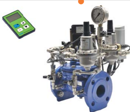
CONTROLLER 2 STEP + PRESSURE MONITORING