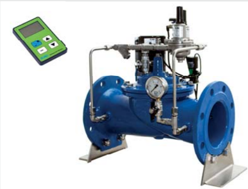
CONTROLLER 2 STEP NIGHT/DAY