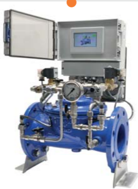
ACMO PMD MODULATING ELECTRONIC CONTROLLER