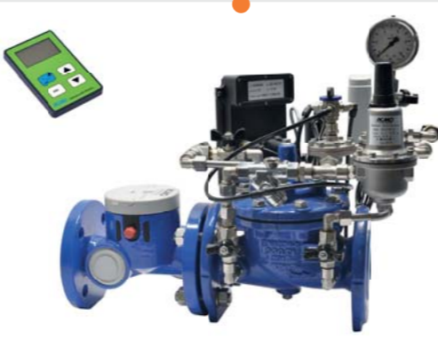
CONTROLLER 2 STEP + PRESSURE MONITORING + FLOW METER